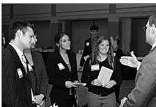
The Tribal Law and Government Center prepares a new generation of advocates for careers representing the legal interests of indigenous nations and tribes.

For more information about the program, see the Admission section of the law school's Web site, www.law.ku.edu .