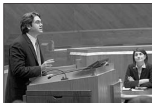
Certificate programs allow students to focus on an area of law and develop expertise in it.

The law school offers 10 joint degree programs: Business, East Asian Languages and Cultures, Economics, Health Services Administration, Indigenous Nations Studies, Journalism, Philosophy, Public Administration, Social Welfare, and Urban Planning. These programs permit a student to receive a master's degree and a juris doctor degree in less time than it would take if the programs were pursued separately. In all cases, a student must be admitted to the law school and the other school or department. In the case of the joint law and business program, an applicant must take the Graduate Management Admission Test as well as the Law School Admission Test. For more information on the joint degree programs and the requirements for each program, see the Academics section of the law school's Web site, www.law.ku.edu .